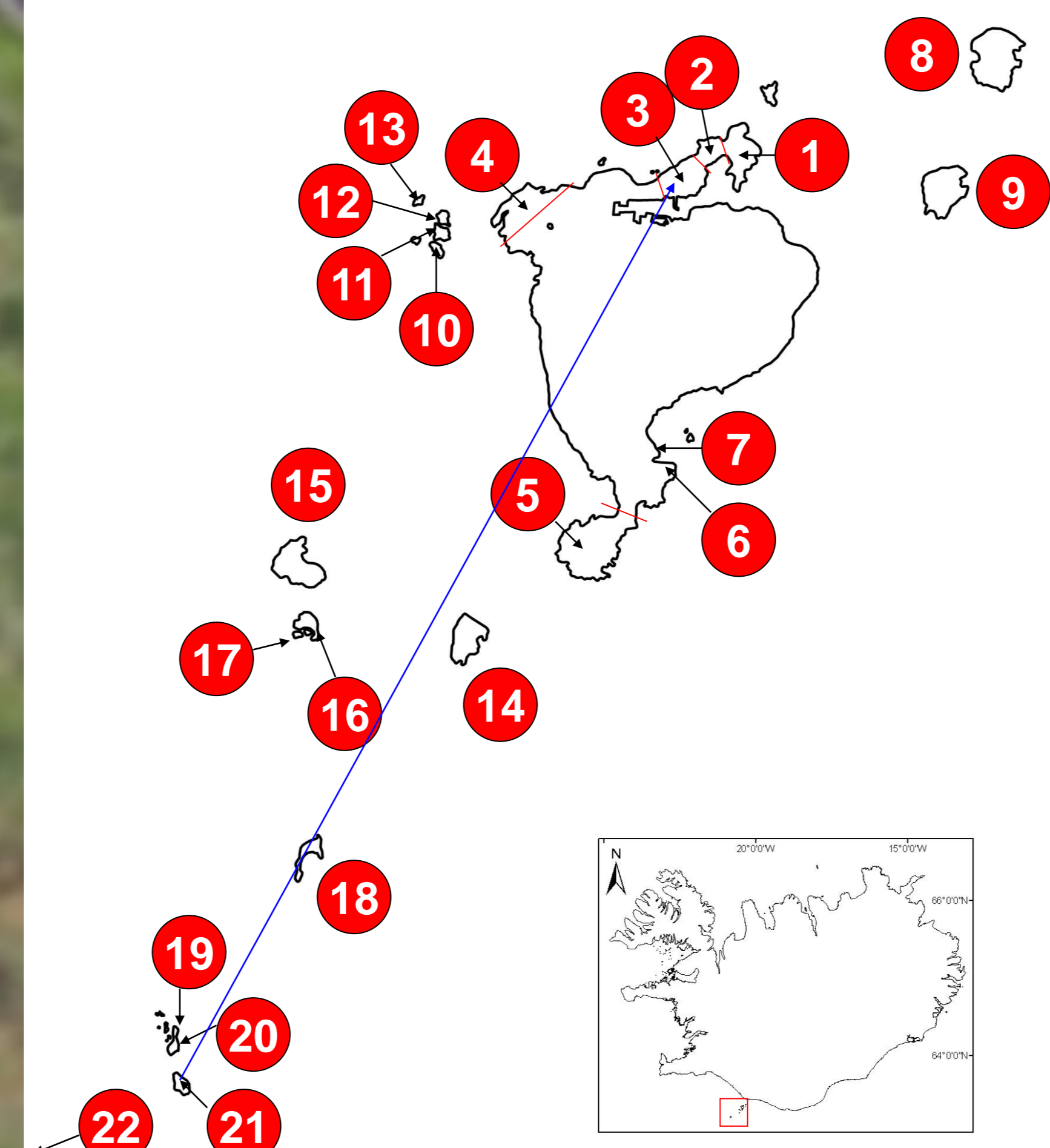
Figure 2. Atlantic puffin colonies distribution in Vestmannaeyjar. Encircled numbers refer to specific colony information in Table 1.